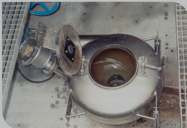
Figure 3: HYDROVEX® HHV-E in operation. The access cover is open for inspection