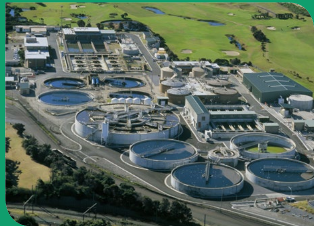
Illawarra, Sydney, Australie