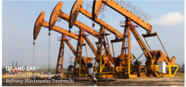
OIL AND GAS Produced Water Treatment Refinery Wastewater Treatment