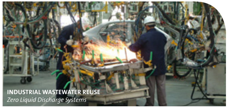
INDUSTRIAL WASTEWATER REUSE Zero Liquid Discharge Systems