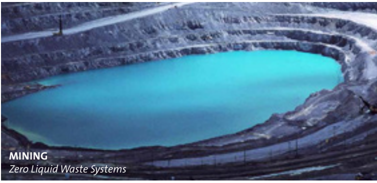
MINING Zero Liquid Waste Systems