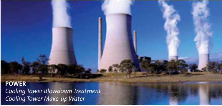
POWER Cooling Tower Blowdown Treatment Cooling Tower Make-up Water