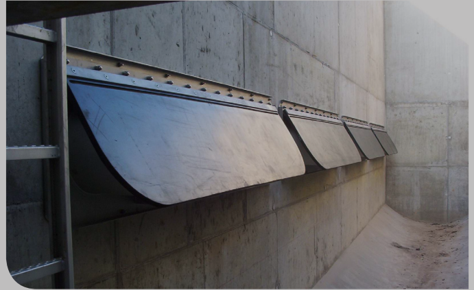
Figure 1: HYDROVEX® LCV check valve, typical installation

The HYDROVEX® LCV Check Valve has been specifically developed to completely seal the overflow weir and prevent backwater from entering the main sewer network. The installation of a HYDROVEX® LCV is very simple, and it can be installed in new or existing structures. Furthermore, the check valve can be used as an odour control device.